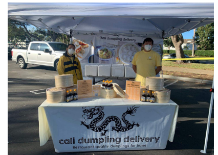
Farmers Market in Torrance