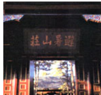
World Cultural Heritage Mountain Resort