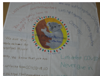
Flag for Camden

We couldn't hold the youth exchange program this year either, but Camden/Kashiwa sister cities celebrate the 25th anniversary in 2022. We are to hold Camden Day in March 2022. For this event we are planning to invite guests from Camden and hold lectures, exchange events as well as a photo exhibition. We believe it will be a great opportunity for the citizens of Kashiwa to get to know Camden.