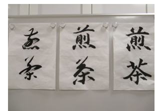
Sosho Gyosho Kaisho

We will upload the lesson video on our YouTube channels as soon as it's ready. We hope you will be interested in Shodo , and we hope next time you will be able to join us.