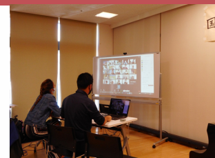
Online Meeting with friendship and sister cities

Please look forward to next year. We will improve it even more by answering everyone's voice.