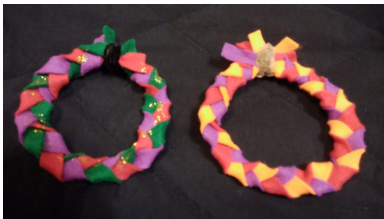
Christmas wreaths made by Girl Scout Team 12

Children experienced how to make disaster prevention supplies at the International Exchange Week venue. Foreigners also made disaster prevention slippers out of milk cartons together. Also, it seemed that parents and children had a good time in making Halloween and Christmas wreaths.