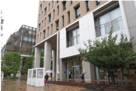
Kashiwanoha Urban Design Center

The 2020 youth exchange program was postponed to the following year due to the pandemic and it was further postponed to 2022. Online exchanges with TSCA (Torrance Sister City Association) are continuing to encourage delegate students who can hardly come to Japan. We planned five online exchanges programs in total, beginning in May. We made groups and each group is in charge of it. On September 4th, the third online exchange was held, and volunteers from the 43rd year delegate students also participated in it. We made a video with the theme of the old Kashiwa(the Former Yoshida Residence) and the new Kashiwa(Kashiwanoha smart city). In the video, we talked about Kashiwa city, which has been transformed into a suburb of Tokyo. Kashiwa’s senior delegate students also added a message to cheer up the uneasy delegate students of Torrance due to postponement of their visit.