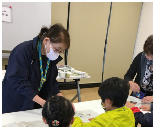
Making emergency supplies by Girl Scout team 17

The 2020 youth exchange program was postponed to the following year due to the pandemic and it was further postponed to 2022. Online exchanges with TSCA (Torrance Sister City Association) are continuing to encourage delegate students who can hardly come to Japan. We planned five online exchanges programs in total, beginning in May. We made groups and each group is in charge of it. On September 4th, the third online exchange was held, and volunteers from the 43rd year delegate students also participated in it. We made a video with the theme of the old Kashiwa(the Former Yoshida Residence) and the new Kashiwa(Kashiwanoha smart city). In the video, we talked about Kashiwa city, which has been transformed into a suburb of Tokyo. Kashiwa’s senior delegate students also added a message to cheer up the uneasy delegate students of Torrance due to postponement of their visit.