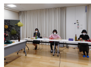
Lecture on how to use Furoshiki