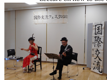
Erhu and guitar performance