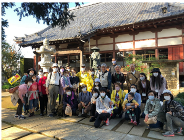
In front of the statue of Kobo Daishi in Kichijoin temple

The weather was sunny and warm, it was a perfect day for walking. A total of 30 people from three year-old to the senior walked comfortably for more than 8 kilometers. This is the third walking tour for us. This year it was changed to a half a day course due to the Covit-19 pandemic. We visited historical temples and shrines such as Kichijoin temple, Himemiya shrine, Tenman shrine, and Ioji temple. The walking course was full of variation passing through a residential area and country roads in Kashiwa-tanaka district. There were favorable comments from participants like “I am glad to know the nearby sights.” or “I am looking forward to a walking tour next year too.” The participants seemed to enjoy interaction with each other very much.