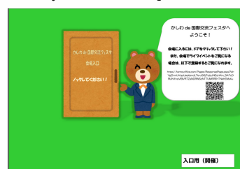
←Entrance of the virtual venue