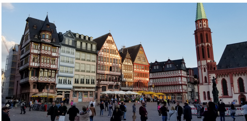
Old city area in Frankfurt →