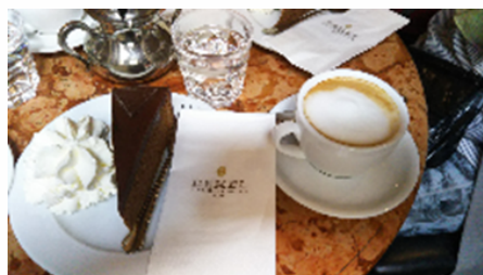
Sacher Torte and Wiener coffee