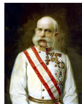
Franz Joseph 1