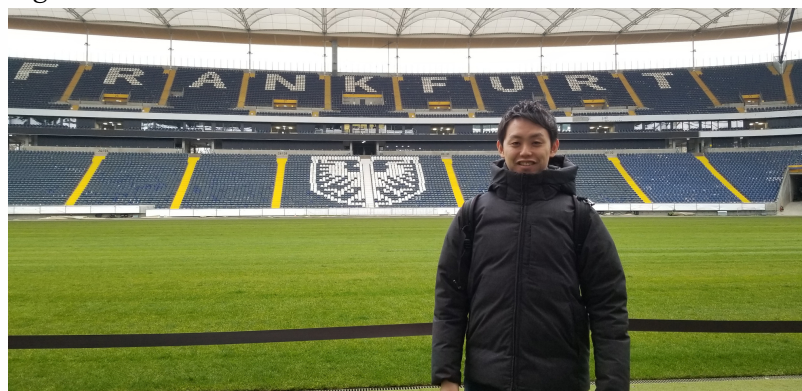
←At a soccer stadium in Frankfurt

Travel restrictions make me feel the difficulty of visiting foreign countries even more strongly. Therefore, I came to think that it was a surprising thing that I could go to Torrance only half a year after the Great East Japan Earthquake. It is a shame that the delegation has been suspended because of the pandemic, since I know how much students can grow up by the program by experiencing the leader twice. It won't be easy but I strongly hope that the program will start like before.