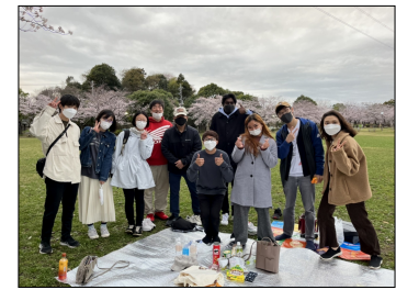
At Kashiwa Furusato Park

This was the first outdoor event organized by KEYS in two years. Tempted out by the warm spring weather, we all went together to see cherry blossoms in Kashiwa Furusato Park. The participants were two students starting college this April, a high school student who was an exchange student to Camden, two students from New York and California, three students from Asia, and the KEYS supporters. On such topics as our schools, hobbies, and the places we live, the KEYS students talked in English in a way that was easy to understand. Reciprocally, we learned from the American guests that personality traits and customs are different between the East Coast and the West Coast. Also, we