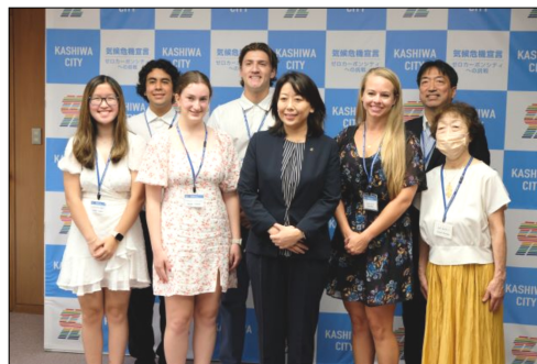
Courtesy Call to the Mayor