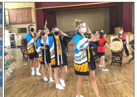
Japanese Drum and Kashiwa Odori Dance