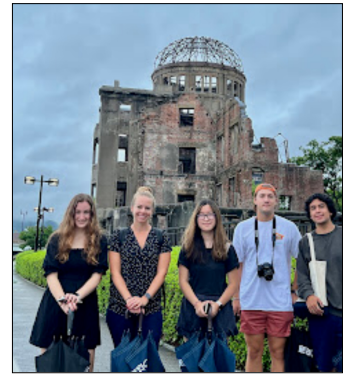
Visit to Hiroshima

On the 25th, the group left Kashiwa for their home with such wonderful memories in their hearts.