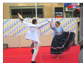
Peruvian Dance (2019)