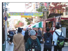
Booths all lined up in Howdy Mall (2019)

(Details will be given in the November issue.)