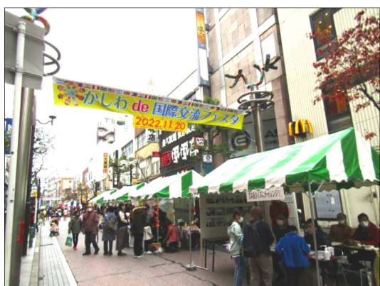
Howdy Mall with booths lined up

Due to the COVID-19 pandemic, the Festa was held as a hybrid at Palette Kashiwa and online in 2020, and only online in 2021. At last, it was held in-person at Howdy Mall, Kashiwa Station East Exit, for the first time in three years. Although the weather forecast predicted rain on the day and we were all worried, both the stage performances and the booth operation went smoothly.