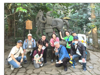
With the statue of Minamoto no Yoriie, dedicating a horse to the shrine

We enjoyed the interaction as we strolled around the spacious shrine grounds while guiding the visitors. There were also many families visiting the shrine for the Shichi-Go-San festival, and it was good to be able to introduce one of Japan's cultural traditions. We would like to continue to conduct local interactive activities.