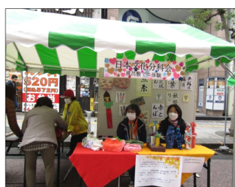
Furoshiki wrapping experience