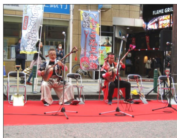
Tsugaru "shovel" shamisen

the food and beverage booths by vendors satisfied the stomachs of the visitors, who were able to taste Korean, Taiwanese, Thai, Nepalese, Vietnamese, Turkish, and American cuisines. With careful infection control, we could hold the in-person event this year. The day made us keenly aware of the importance of having face-to-face interaction between people.