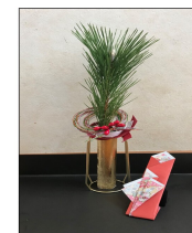
A pine ornament and a chopstick bag