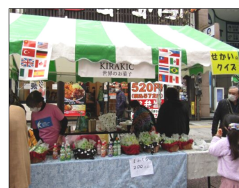
Sweets from around the world