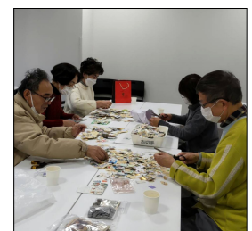
Sorting out used stamps

KCC collects used stamps, greeting cards, miswritten postcards, and foreign coins as one of its international support activities. We have sorted out the stamps brought to KCC and have sent them together with used greeting cards to the Green Earth Defense Fund, which works to preserve greenery around the world. The postcards are sent to "Japan Committee, Vaccines for the World's Children," and the foreign coins are sent to "UNICEF Foreign Coin Donation" for children around the world. We are very grateful for your cooperation. Thank you for your continued support.