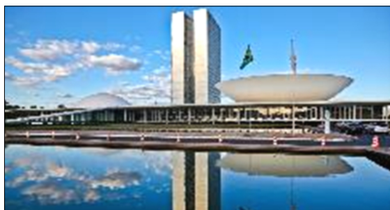
Brasilia, the capital of Brazil