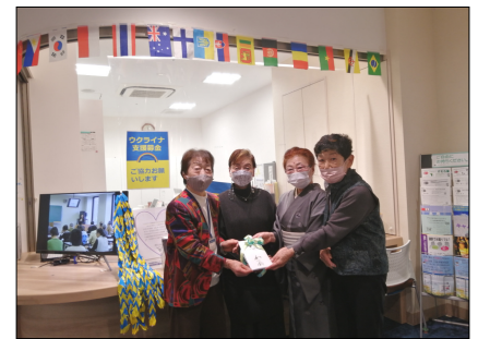
Members of Wa no Kai

They said, "This is the sales from the flea market as well as the donations we collected for the Ukrainians who had taken refuge in Kashiwa city after the Russian invasion. We would like to continue to interact with the Ukrainian people, and if there is a project that will bring economic benefits, we would like to cooperate with them to develop it."