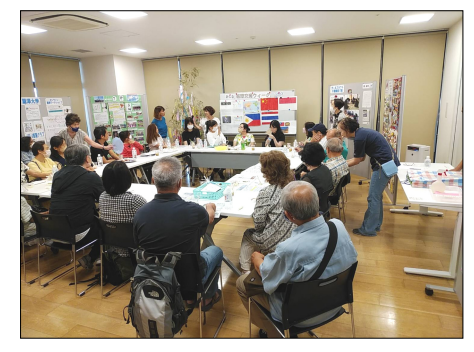
Getting to know Indonesia, Thailand, the Philippines, and Taiwan.

We had a Chinese guest. As it was the day of Tanabata, we asked about the difference between Tanabata in China and Japan. We learned that Tanabata falls on August 21 in China because of the lunar calendar, and that it is a day like Valentine's Day rather than a day to make one's wishes. While eating Chinese snacks, we had friendly Q&A exchanges. Some