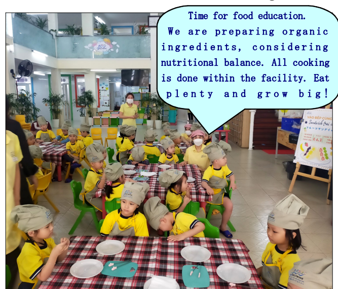
A Kindergarten in Vietnam

In 2016, we established a subsidiary in Vietnam and have been running kindergartens and educational facilities. As Vietnam is a socialist country, everything from business concepts, and contractual concepts, to parental values is different from Japan. Through such differences, we discovered that there is a significant demand for "Japanese education methods". During the COVID-19 pandemic, with just a single notice, both the kindergartens and educational facilities were subject to lockdown, with no government guarantees or support. We are grateful to our Vietnamese staff who worked so hard to overcome the situation where more than 100 local kindergartens closed. This year, we are finally on