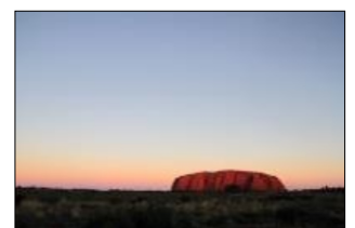
Uluru(Ayers Rock) in Australia