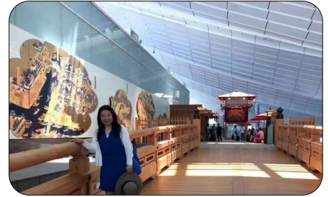
At Haneda Airport "Edo Koji"

What motivated you to join KIRA's Chengde Committee? -I am who I am today thanks to the kindness and hospitality of everyone since I came to Japan. And now Japan is my second home to me. I learned about the sister city relationship between Chengde city and Kashiwa city when I wondered if there was something I could do to help. I found out on the Internet that Chengde city has sister cities with both Kashiwa and Takasaki, I chose Kashiwa as it is closer and joined the committee.