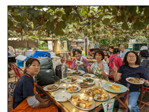
Enjoyed the flavors of the world

We enjoyed the flavors of the world: seasoned pork, chicken, and pudding from the Philippines; spicy vermicelli salad from Thailand; spiced beef from China and Taiwan; quesadillas from Mexico; sausages and croquettes from Brazil; and yakisoba fried noodles from Japan.