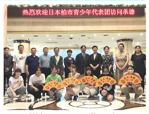
Welcome party in Chengde

Before the visit, I had the impression that Chinese people were strong-willed and a little scary, but my impression vanished upon arrival. I learned that they are highly hospitable and friendly people, and that there is a big difference between when they are serious and when they are having fun. My host family treated me like their real daughter and welcomed me with many questions and treats, giving me the "best hospitality". Knowing that high school students study from early in the morning until late at night, and that they have only