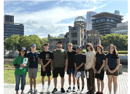
Wishing for world peace