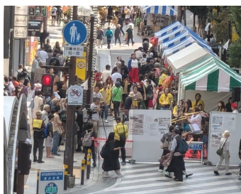
The venue of last year's festa