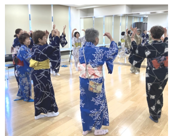
Wear yukata and dance in a circle

After dressing, everyone formed a circle and danced the Kashiwa Odori. Moving together naturally broke the ice, creating a refreshing sense of togetherness despite the summer heat.