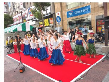
Dance in Guam