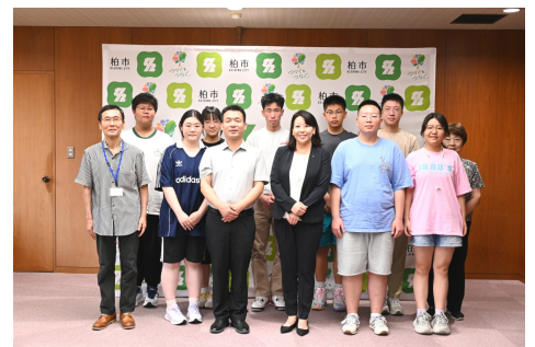
Courtesy visit to the mayor

In addition, Kashiwa received an official letter of gratitude from the Chengde Foreign Affairs Office for the warm welcome and hospitality extended to their students. We hope to continue strengthening and expanding our ties with Chengde in the years to come.