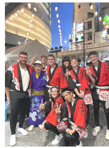
A highlight of the exchange : Kashiwa Dance

In addition to activities in and around Kashiwa, they also took a three-day excursion to Hiroshima and Kyoto. While showing deep respect for Japan’s culture and history, they also learned many things there. At a time when news around the world continues to report on conflicts in certain regions, Japan — marking the 80th anniversary of the end of World War II — is once again sending out a message of peace at home and abroad. This exchange program was a reminder that the great significance of international sister-city exchanges and citizen-level friendships lies in promoting peace.